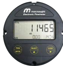
Standard LC Display