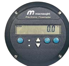
Deluxe LC Display